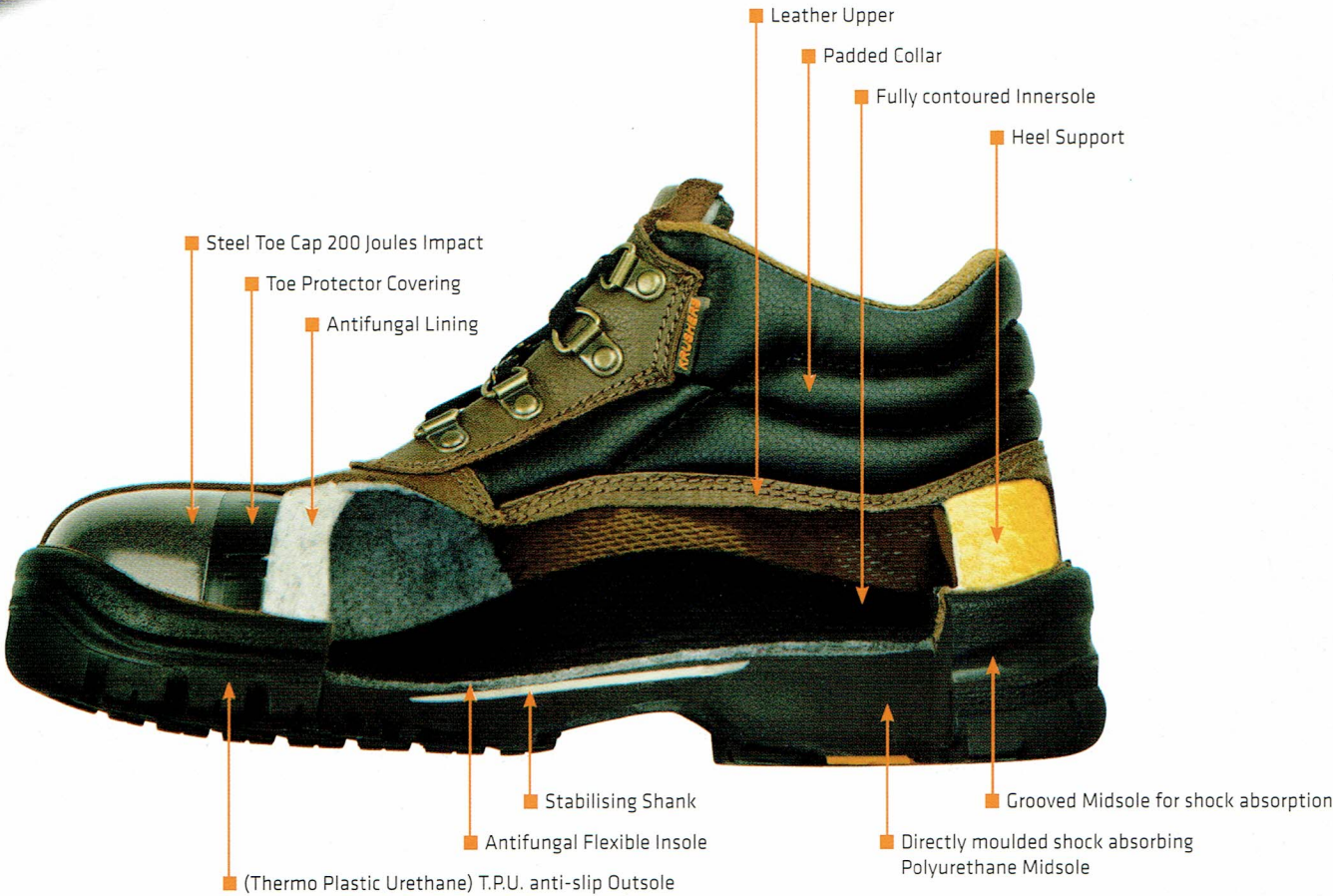
Nitrile Rubber sole