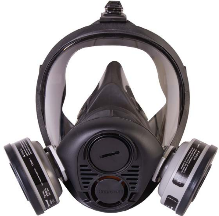
North RU6500, shown with North N-Series Organic Vapor cartridges. Filters and cartridges sold separately.

The RU6500 Series with 4-point headnet easily accommodates other personal protective apparel such as a hardhat or earmuffs.